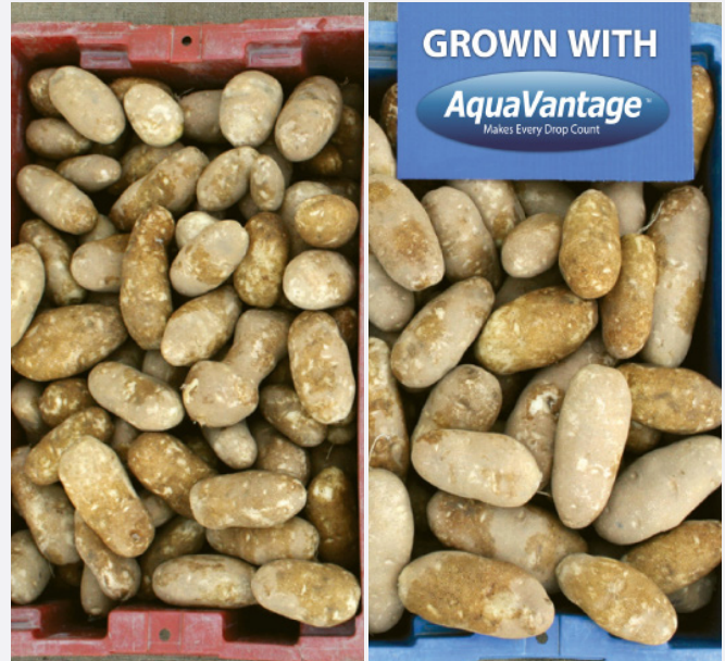
Potatoes, like any vegetable or crop, are typically larger and higher in quality and weight when grown with AquaVantage®

Using AquaVantage, crop yields typically increase anywhere from 8% to 15% among technically advanced growers; even higher yields are possible in less developed regions. Overall taste and physical appearance can be improved, with the example of increased brix (sugar) in tomatoes. Quite simply, food grown with AquaVantage typically tastes and looks better.